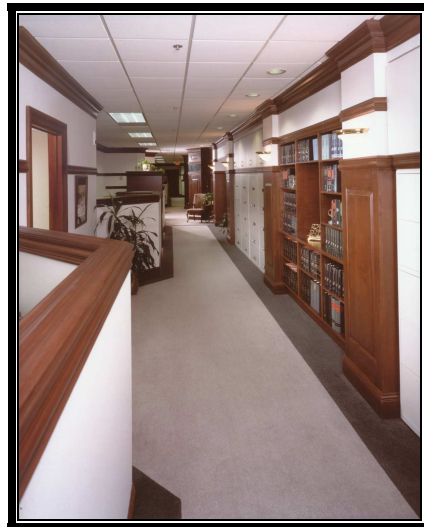
Spacious hallways with accent paneling