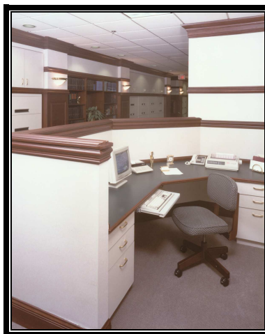
Elegant and efficient administrative areas