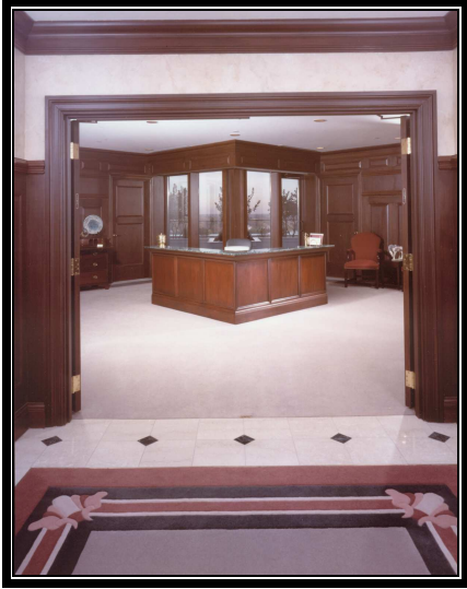
Grand Entrance from private elevator lobby